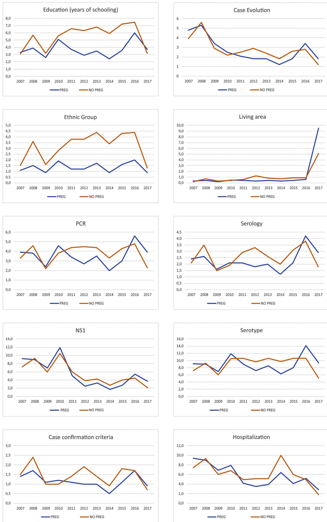
Fig. 2. Incompleteness (in percentage) of the sociodemographic, epidemiological, clinical and laboratory variables of reported cases of dengue among pregnant women and non-pregnant women of childbearing age, Brazil, 2007–2017.