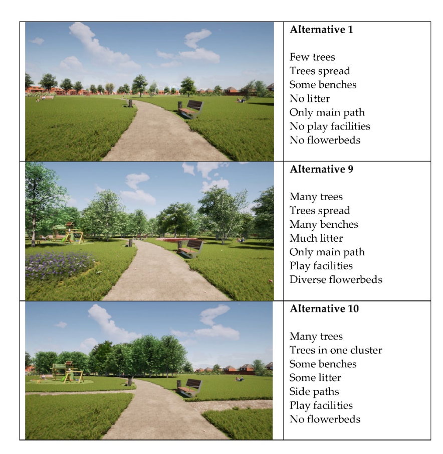
Figure 1. Screenshots of different park alternatives with varied attributes.