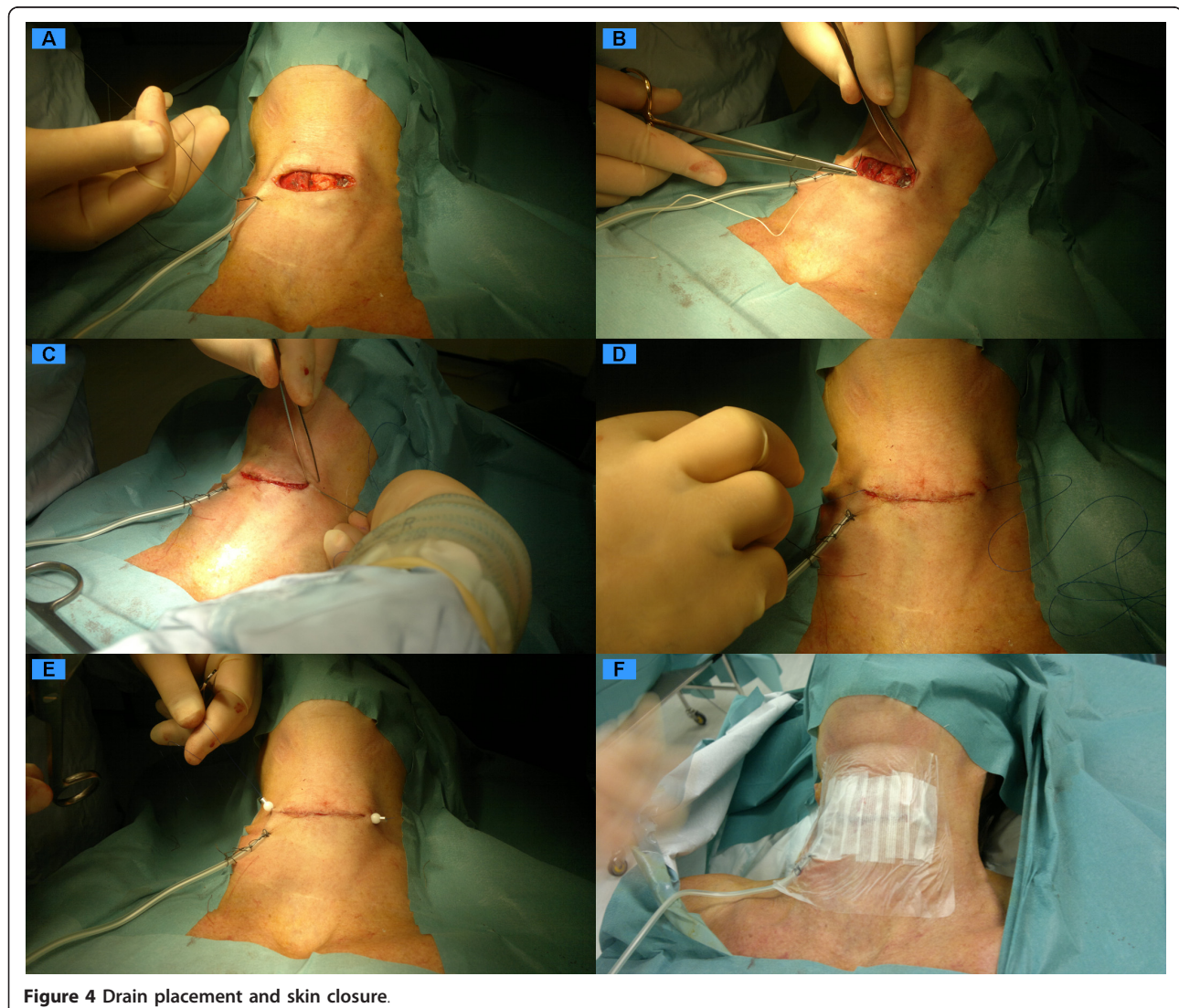
Figure 4 Drain placement and skin closure.

The infra-hyoid muscles if divided are re-approximated and only a few loose sutures are used to