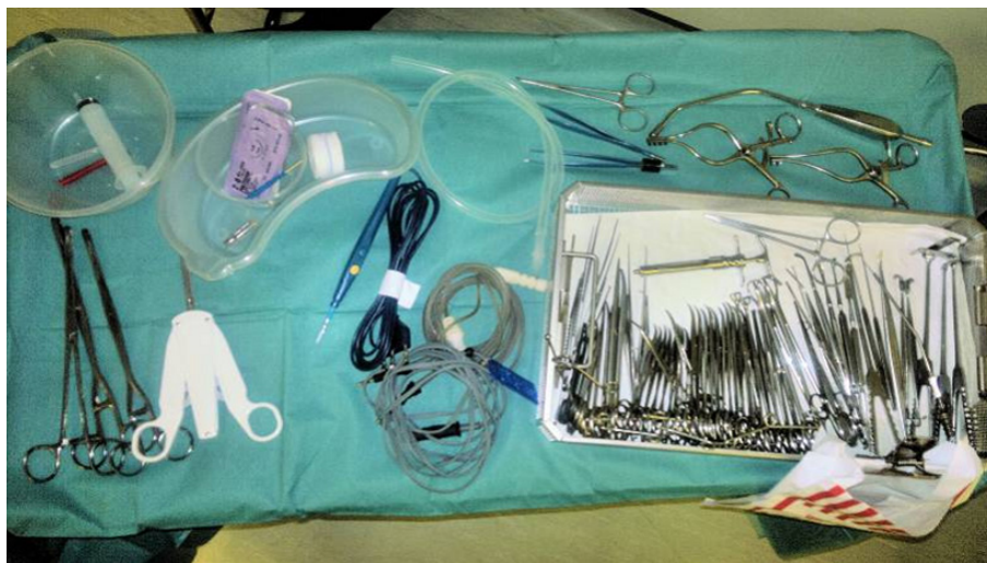
Figure 1 The instrument tray.

There are many arguments for and against nerve monitoring but despite knowing the anatomy and having done this procedure many times we still use the monitor and stimulator for every case but with a healthy scepticism of the results if negative. It is not unknown for the tracheo-laryngeal electrode to become displaced and give a false negative reading, similarly the unfamiliar anaesthetist may have used a temporary neuromuscular blocking agent or the local anaesthetic used may still have an effect. We use it to confirm surgical dissection only and to acquaint the team with its benefits and pitfalls through familiarity. To not use an aid when