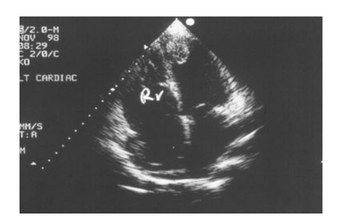
Figure 3 A 30 yr old female thalassaemia patient 2-D four chamber view with the presence of an apical thrombus.

Doppler echocardiographic study usually shows biventricular dilatation and systolic and diastolic dysfunction. The variety, however, of the different abovementioned pathogenetic factors and their degree of contribution to the cardiac damage, including the different treatment regimes (lower transfusion schemes, inadequate chelation) lead TM patients, who present with CCF not always to show uniform cardiac injury. Restrictive cardiomyopathy-constrictive pericarditis or high cardiac state Doppler echocardiographic findings could present either alone or in combination. The development of significant PHT may accompany the CCF in almost all the above forms, contributing to the precipitation of right-sided heart failure. In cases with impaired LV function, thrombus formation in the apex of the heart may be present and can lead to the development of stroke (52) (Fig. 3).