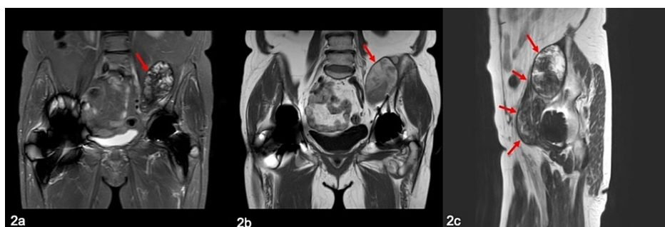
FIGURE 2: MRI of enlarging pseudotumour (red arrows) with evidence of haemorrhage in 2018.

The patient was investigated with MARS-MRI, which showed a substantial interval increase in the size of the residual pseudotumour. The persistence of the characteristic low signal rim confirmed the expansion of the mass. New, diffuse areas of high T1 signal were seen throughout the mass in keeping with areas of haemorrhage. The pseudotumour was retroperitoneal, extending into the femoral canal measuring 30 \times 30 \times 140 mm (Figure 2). Inflammatory markers and metal ion concentrations were reassuringly low. An aspiration of the hip was performed which confirmed blood products. Subsequent microscopy and culture investigations failed to detect any evidence of infection. A further MARS-MRI showed an increase in the size of this pseudotumour to 48 \times 42 \times 150 mm.