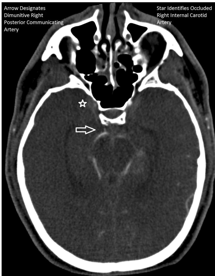
Figure 2 CTA brain coronal image demonstrating diminutive right posterior communicating artery.

and the head of the caudate nucleus. A diagnosis of carotid dissection was made as a source without angiography based on history and distribution of infarct the patient. This was treated conservatively without anticoagulation or antiplatelet therapy with near full resolution of his symptoms with residual numbness of the hand at follow up 4 weeks later.