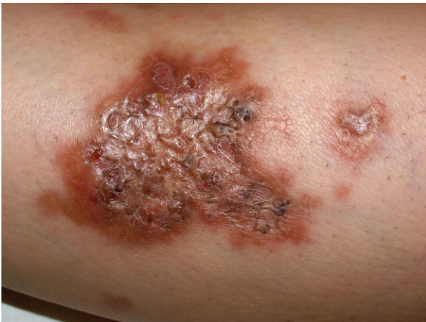
FIGURE 2: Close view of an irregularly shaped brown-yellow plaque with comedo-like papules.