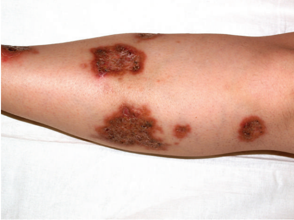
FIGURE 1: Infiltrated circinate plaques, erythematous border, and comedo-like papules in the center on the lower extremities of a 42-year-old diabetic patient.