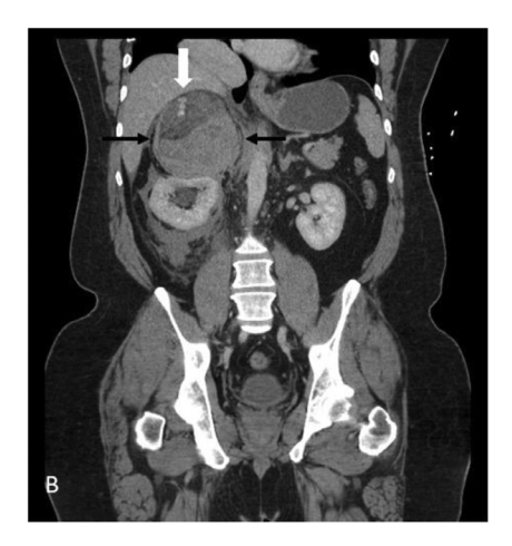
Fig. 1 – Contrast-enhanced axial (A) and coronal (B) CT of the abdomen showing hemorrhage (black arrows) in a fatty mass (white star) with a focus of contrast extravasation in the anterior and superior aspect (white arrow). This mass is located above the kidney and appears to indent it rather than arise from it.