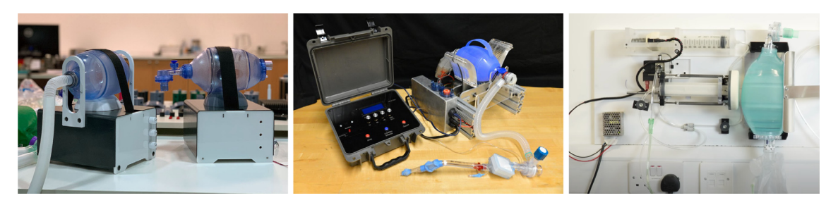
Fig. 3. Different approaches for automating the squeezing of an AmbuBag, via pulleys (VentCore, left), motorized claws (E-Vent, center), pressurized air (Gtech, Right).

essary for ventilation by using an external source of constantly pressurised air that is finely regulated by the MV to achieve PCV. This source of air, called medical air, is usually manufactured by the hospitals on-site, by pulling outside air into a compressor which is in turn connected to a piping system wired into hospital walls. Medical air sockets are usually available next to each hospital bed. In doing so, MVs relying on this approach (PanVent, PC-CMV, MVM, MUR, Vent4us) outsource to the hospital infrastructure the generation of pressurized air that is otherwise achieved via AmbuBags or Bellows drivers. Although this design choice creates devices that might be easier to manufacture and scale, it poses a strong requirement on the infrastructure required to adopt them, as a source of medical air might not be always available (e.g. in hospital tents or in hospitals in developing countries). To be precise, all the three design patterns, like hospital-grade MVs, require an external source of oxygen to meet FiO2 targets required for COVID-19 treatment, which can be provided by either a permanent hospital infrastructure (likewise for medical air) or by portable canisters, as described in Section 4.2.2.