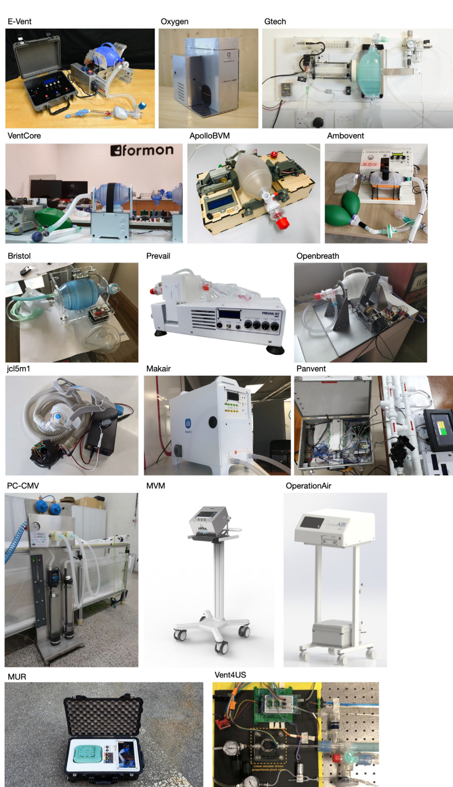
Fig. 5. Photos of the reviewed projects.