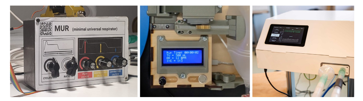
Fig. 4. Three different user interfaces, physical controls (MUR, left), display showing settings (ApolloBVM, center), touchscreen showing real-time sensor data (MVM, right).

After ventilator settings are applied by a physician, monitors and alarms allow for both assessing the correct operation of the MV and the patient's vitals. Designing MVs with feedback loops is incredibly important as the ventilation support needs to adapt to rapidly changing conditions, such as the patient moving between different levels of sedation, their condition improving or worsening. Once more, the capability of ingesting data from multiple sensors and rapidly compute settings to be applied (via proprietary algorithms) is one of the characteristics of regular MV machines that is often overlooked by OSH projects. Although all projects that provide settings for ventilator parameters make those settings visible via physical knobs and gauges; only a selection of devices embeds sensors to monitor and display the airway pressure in real-time, either