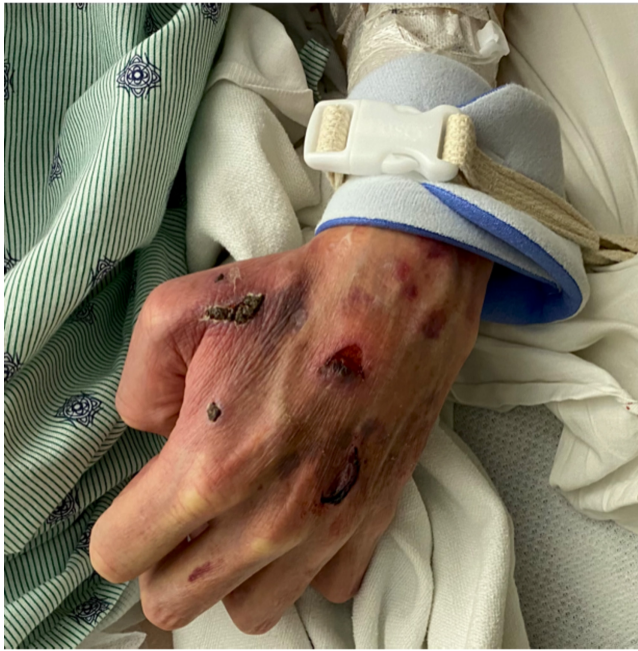
FIGURE 1 Crusted skin lesions on the back of hands due to excess porphyrin in the skin resulting in photosensitivity

magnesium and phosphorus levels, thyroid-stimulating hormone, vitamin B12, and folic acid levels. Blood ethanol level was <10 mg/dl. The urine toxicology screen was negative.