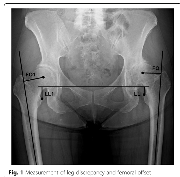
Fig. 1 Measurement of leg discrepancy and femoral offset

The preoperative femoral offset was measured as the perpendicular distance between the center of the femoral head and the long axis of the femur. Preoperative leg length was measured as the perpendicular distance between the interteardrop line and the lesser trochanter. Leg length discrepancy was calculated as the affected side minus the healthy side (Fig. 1).