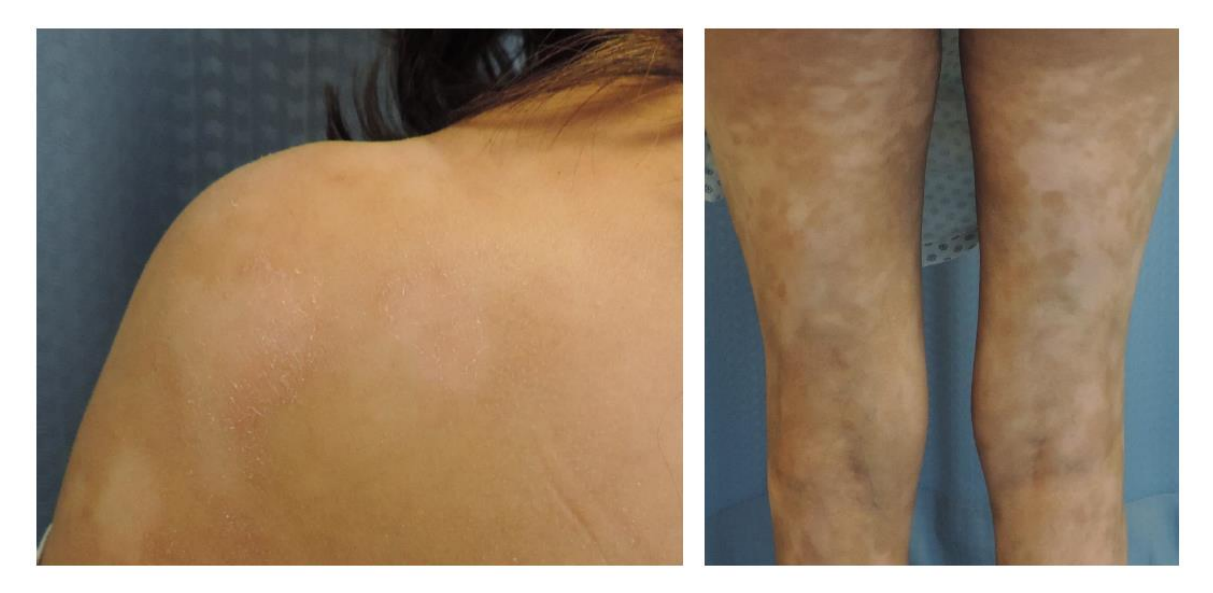
Figure 1. Clinical images of hypopigmented mycosis fungoides (HMF).

HMF is characterized by light colored to achromic lesions, mostly patches or thin plaques (Figure 1) [8,9]. Nonetheless, tumors have been reported in rare patients [10,11]. Currently, the most accepted hypothesis explains that the light colored to achromic skin lymphoma is due to damaged and reduced number of melanocytes in addition to abnormal melanogenesis [8,12].