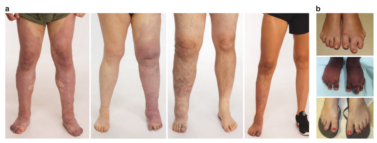
Fig. 2 Patient photographs of characteristic clinical phenotype. (a) Capillary venous malformation with limb overgrowth (Klippel–Trenaunay). (b) Macrodactyly with sandal toe deformity.