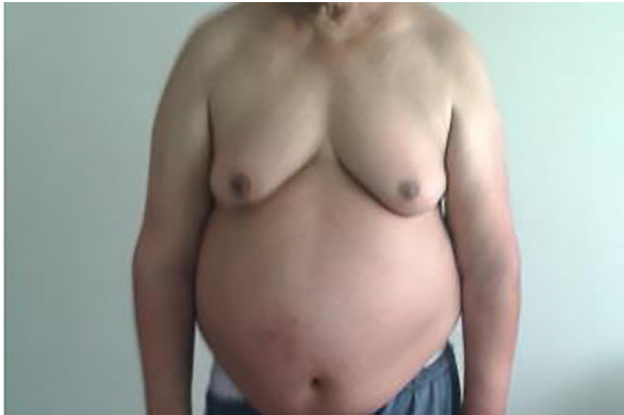
Fig. 2. Gynecomastia in a patient with Klinefelter syndrome.

status, particularly the antiphospholipid antibody syndrome [3,9]; a heterozygous state for factor V Leiden mutation 1691G>A [10]; compound heterozygosity for factor V Leiden 1691G>A and prothrombin 20210G>A mutations [8,11]; increased factor VIII coagulant activity (factor VIII: C) [12]; and homozygous MTHFR 1298A>C mutations [13].