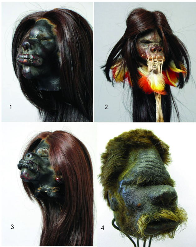
Fig. 1 View of the shrunken heads (The State Ethnographic Museum, Warsaw, Poland: no.1- PME 5261, no.2- PME 12272, no.3- PME 5260; The Museum of the Department of Forensic Medicine at Jagiellonian University Medical College, Krakow, Poland: no.4)

neck in all four shrunken heads. This surface had no direct contact with the outside environment. Each sample was collected into a sterile 1.5-mL Eppendorf tube and incubated overnight at 42 °C prior to DNA extraction. DNA was extracted by enzymatic digestion and ion-exchange column extraction using Sherlock AX kit (A&A Biotechnology, Gdynia, Poland) according to the manufacturer's recommendations. The concentration of DNA was determined by spectrophotometry at 260 nm using a GeneQuant RNA/DNA Calculator (Pharmacia Biotech, Cambridge, UK). PCR amplification was performed in a standard thermocycler (Perkin Elmer GeneAmp 2400, Applied Biosystems, Foster City, USA) and contained 4 ng template DNA in a final reaction volume of 25 µL. Five commercially available reagent kits for typing of genomic short tandem repeat (STR) markers were used to study nuclear DNA (nDNA): AmpFISTR Identifiler PCR Amplification Kit, GlobalFiler Amplification Kit, AmpFISTR Yfiler PCR Amplification Kit, and AmpFISTR Yfiler Plus PCR Amplification Kit (all from Applied Biosystems, Foster City, USA). Investigator Argus X-12 Kit was used to type for X-linked STR (Qiagen GmbH, Hilden, Germany). These reagents were validated by the manufacturer and had