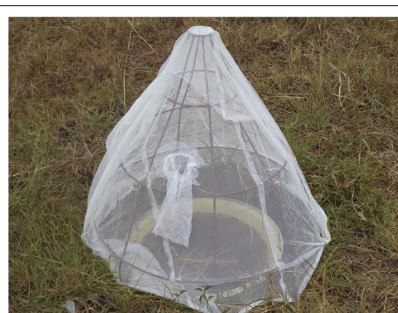
Figure 1 Standardized field test set up. Netting-covered emergence trap on top of artificial pond.

Forty artificial ponds (diameter 0.42 m) were set-up as described above in a semi-field system. Here the ponds were arranged in four parallel rows with 10 ponds in each row. Batches of 50 insectary-reared third instar An. gambiae s.s. larvae were introduced into each pond. Thereafter, 20 of the ponds were randomly selected and treated with AMF at 0.12 ml/m 2 , the dose that killed 50% of larvae in laboratory dose-response tests. To obtain this dose, 16.8 µl of AMF was applied at the edge of