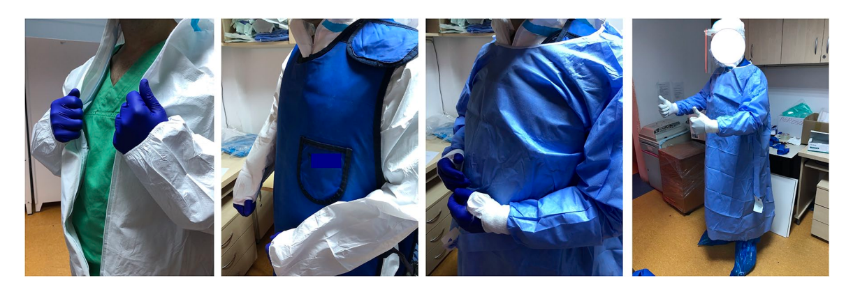
Figure 1. Donning of multilayered PPE for ERCP in COVID patients. COVID, coronavirus disease; ERCP, endoscopic retrograde cholangiopancreatography; PPE, personal protective equipment.

and the use of personal protective equipment (PPE) to prevent SARS-CoV-2 transmission, resulted in a multilayered and cumbersome outfit, including regular scrubs, a first layer of water-resistant PPE overalls (in two of the centers), lead shielding and a second water-resistant layer (surgical gown; Figure 1). Disposable duodenoscopes were employed in one of the centers with the aim of reducing the risk of transmission during the reprocessing process. Finally, negative-pressure rooms were only available in one center.