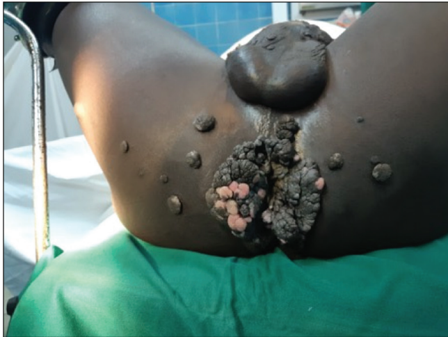
Figure 3: Perianal, buttock, scrotal, and penile cauliflower-like vegetative condyloma

lesions on the anal margin. Locoregional examination did not reveal any evidence of pathologic lymph nodes. HIV, hepatitis B, and syphilis serology were negative. Full blood count and renal function tests showed normal results. Proctoscopy did not show any associated rectal lesion. Biopsy was not performed. Surgical excision, under locoregional anesthesia, using cold scalpel, electric scalpel, and aspiration was performed. It removed the perianal, scrotal, penile, and buttocks masses in one step, ensuring adequate excision margins [Figure 4].