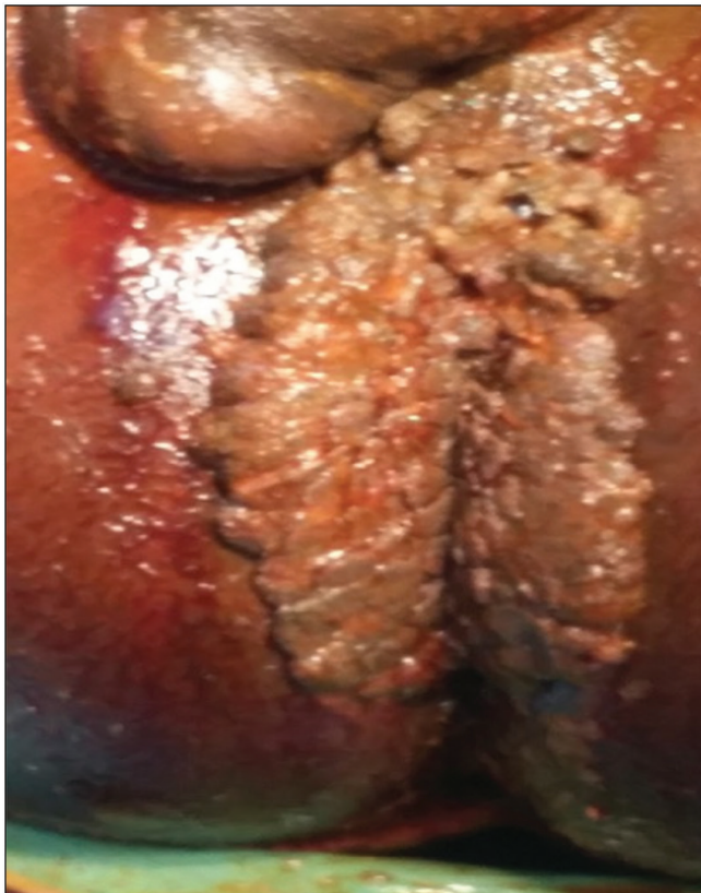
Figure 1: Perineal and perianal condyloma lesion

Examination revealed a patient in good general condition who was not pale. Examination of the cardiovascular and respiratory systems and of the abdomen did not reveal any abnormalities. Perineal examination revealed a vegetative mass with cauliflower-like appearance on either side of the anus [Figure 1]. Digital rectal examination did not reveal any rectal extension. Locoregional examination didn't reveal any pathologic lymph nodes. Results of full blood count and renal function tests were normal. Retroviral (HIV1 + 2) and syphilis serology (TPHA) tests were negative.