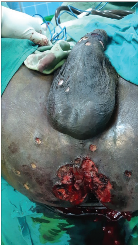
Figure 4: Perineal, buttock, and penile condyloma excision

Postoperatively, regular antiseptic solution for wounds care was performed until healing [Figure 5]. Histopathology confirmed BLT without signs of malignancy [Figure 6]. Regular follow-up has been ongoing and there has been no recurrence after 24 months.