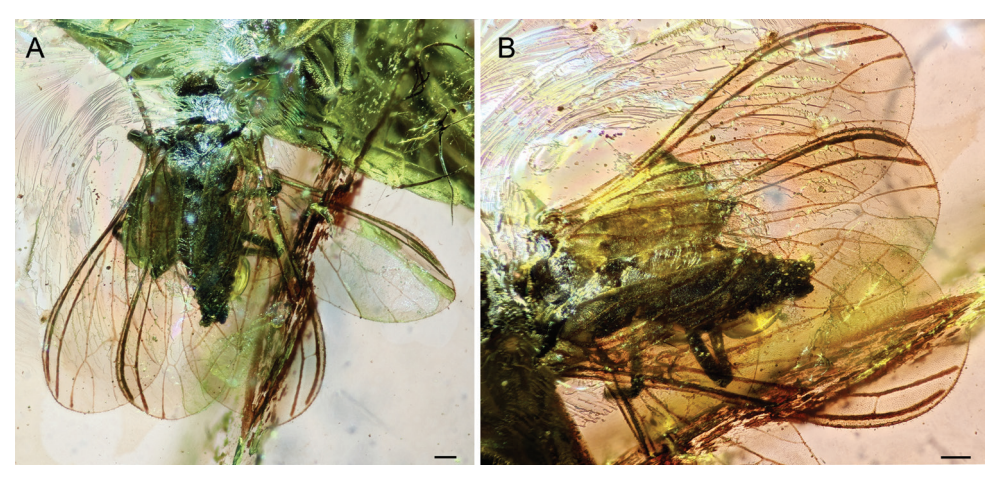
Figure 2. Mulleroconis hyalina gen. et. sp. n. holotype BUB 2907. A Habitus dorsally B wing venation - detail. Scale bar: 100 μm.

ca. 1.25 mm long, ca. 0.55 mm wide with venation very similar to forewing, differing in position of sinuate crossvein rp2-ma; crossvein m-cua partially preserved and basal part of wing with hardly recognizable venation pattern. Legs slender; fore femora (only left femur is visible) a bit shorter and wider than femora of second and third pair of legs; tibias covered with setae; tarsi five-segmented; first tarsomere distinctly longer than remaining tarsomeres; fifth tarsomere elongated with two apical claws. Abdomen large, length 0.64 mm, width 0.22 mm, including genitalia, with widest part approximately in middle of its length, greatly tapering to narrow apical segments; abdominal plicatures absent. Genital structures hardly discernible, presumably below projection of gonarcus, ultimate apices of parameres visible from dorsal view.