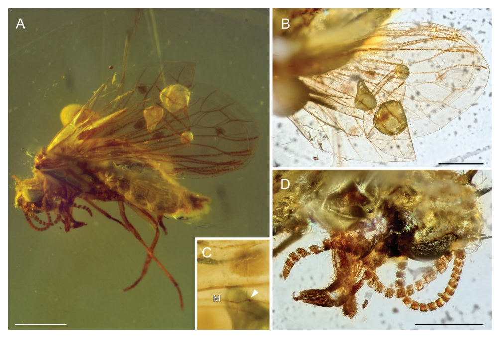
Figure 4. Palaeoconis azari gen. et sp. n., holotype BUB 2914. A Habitus lateral view B wing venation and spots C detail of forewing venation with stiff seta on vein M D head from dorso-lateral view showing antennae, terminal segment of maxillary palp and eye. Scale bars: 500μm ( A, B ); not in scale: ( C ); 50 μm ( D ).