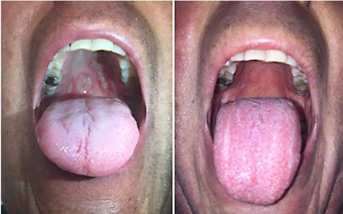
Fig. 1. Lesions of the tongue and palate before (left) and after (right) treatment with palliative radiation to the oropharynx.