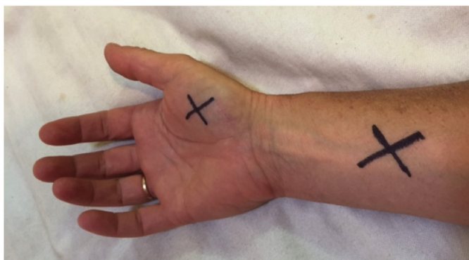
a) Thenar eminence and volar forearm sites

Cold detection and cold pain thresholds. Cold detection threshold (CDT) was tested first at each site. Any subject who failed to detect cold within 10°C of the starting temperature was excluded from further testing. Cold pain threshold (CPT) tests were then completed at each