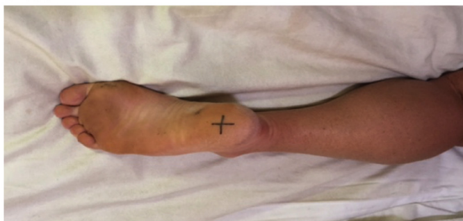
c) Plantar heel site