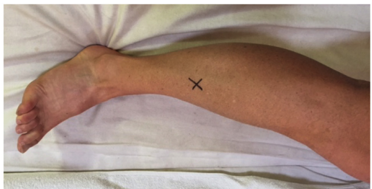
b) Tibialis anterior site