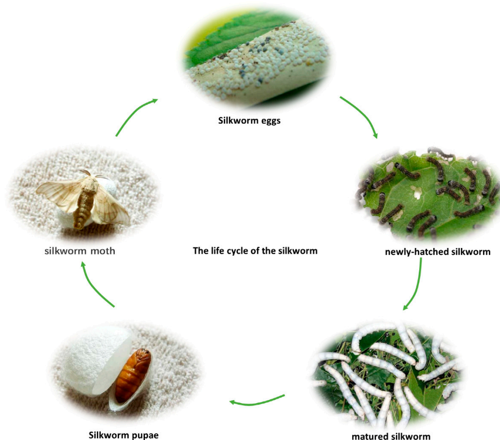
Figure 1. The life cycle of the silkworm.

species are different. The biggest difference between the different species of silkworm pupae is the source of the silkworm's diet and the degree of domestication. For example, the mulberry silkworm, which eats mulberry leaves, is the silkworm that has been fully domesticated and is the most widely farmed [4]. Rich in proteins, oils, chitosan, vitamins, polyphenols, and other nutrients, silkworm pupae have long been used as an important source of high-quality proteins and lipids [9]. Silkworm pupae protein contains 18 amino acids and is rich enough in essential amino acids to meet the amino acid requirements of humans and is beneficial to human health [10,11]. Silkworm pupae oil contains a large number of unsaturated amino acids, especially Omega-3 fatty acids [12].