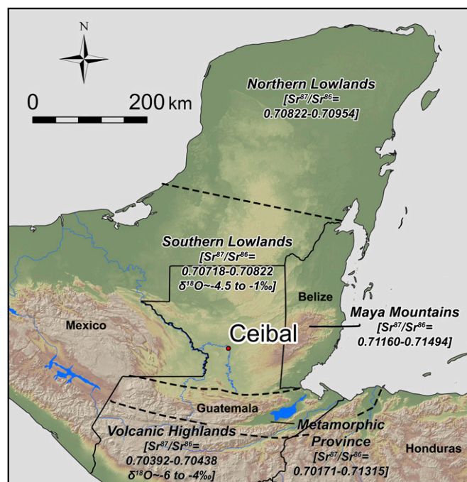
Fig. 1. Map of the Maya region with strontium and oxygen isotope values. ^{87}\text{Sr}/^{86}\text{Sr} values from ref. 44, with 2\sigma range around each regional average. Carbonate \delta^{18}\text{O} values using human bone apatite and tooth enamel from previously reported studies (refs. 34 and 35 for the lowlands; ref. 36 for the highlands). Reprinted with permission from ref. 5.

Stable carbon ( \delta^{13}\text{C} ) and nitrogen ( \delta^{15}\text{N} ) isotopes from bone collagen can assess whether animals were fed maize-based diets, the primary grain in Mesoamerica, while held in captivity (14, 15). The \delta^{13}\text{C} values in terrestrial animals vary depending on the proportion of plants they consume that undergo either C3 or C4 photosynthesis. C3 plants have \delta^{13}\text{C} values that average -26\text{‰} , whereas C4 plants, such as maize ( Zea mays ) and arid-adapted tropical grasses, average -12\text{‰} (16–18). At Ceibal, high \delta^{13}\text{C} values would be expected from animals consuming predominantly maize, or animals consuming maize-eating prey, since there are relatively few other elevated \delta^{13}\text{C} sources. \delta^{13}\text{C} in bone apatite and