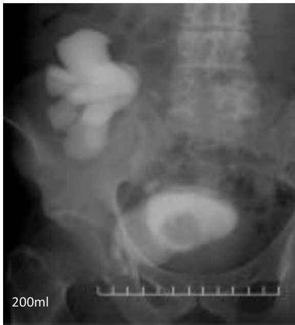
Figure 1. Voiding cystourethrography before HoLEP. Contrast medium was injected from the urethral balloon catheter inserted on admission. Grade 5 VUR was shown.

Postoperative sCr was around 1.2 mg/dl and urination was smooth. However, cystography showed grade 4 VUR to the transplanted kidney. Furthermore, hospitalization was necessary at seven and 8 month after HoLEP because of pyelonephritis with VUR. Thus, it was assumed that repair of VUR was necessary. At 10 months after HoLEP, open surgical repair of VUR was performed. A transplanted ureter was connected to the top of the bladder and there was no intramural urinary tract. The ureteral joint with the bladder was cut and re-anastomosed to the other part of the bladder wall by Lich-Gregoir technique. The operative