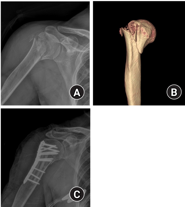
Fig. 2. A 64-year-old man with Neer classification two-part proximal humeral fracture who was treated with open plating with allogeneous fibular bone graft. (A) Preoperative anteroposterior radiography. (B) Preoperative three-dimensional computed tomography scan. (C) Postoperative anteroposterior radiography.

least three bridging calluses observed in the AP and axillary X-ray images. For radiological evaluation, neck-shaft angle was measured on the final follow-up AP images (Fig. 3A) [12]. Malunion was defined as a neck-shaft angle less than 120^\circ on postoperative radiographs during the follow-up period [11]. Plate height was measured as the distance from the lateral end of the humeral greater tuberosity to the upper end of the plate in the final follow-up AP image (Fig. 3B).