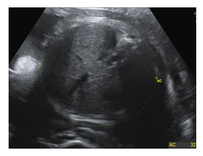
Fig. 2 Normal abdominal circumference at 36 weeks of gestation sonogram.

Follow-up ultrasound to assess interval growth at 36<sup>2/7</sup> weeks revealed fetal mega-cisterna magna at 14 to 16 mm and striking tubular dilatation of the lower digestive tract concerning for complete intestinal obstruction. At that time, the differential diagnosis entertained the following pathological entities: jejunal atresia, ileal atresia, colonic atresia, meconium ileus, intestinal volvulus, imperforate anus, Hirschsprung disease (aganglionic megacolon), and meconium peritonitis. Umbilical artery velocimetry was normal, and neither Doppler interrogation of the middle cerebral artery nor brainsparing reflex activation find any evidence of fetal anemia (peak systolic velocity, 0.97 multiples of the median). Appropriate interval fetal growth was noted (60th percentile to 51st percentile between the two scans); the placenta and uterus were unremarkable and there was normal amniotic fluid volume (amniotic fluid index = 20.5 cm). Interestingly, the standard abdominal circumference views were normal ( Fig. 2 ) and the intestinal dilatation was noted by the examining sonographer on a more caudal plane. Prolonged external fetal monitoring and testing on that day was reas-