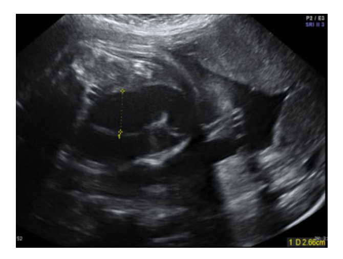
Fig. 3 "Coffee bean" sign at 36 weeks of gestation sonogram.

Sonographic findings of intestinal volvulus were first reported in 1983.<sup>6</sup> Prenatal diagnosis and sonographic findings suggestive of in utero volvulus are important for multidisciplinary planning at the time of delivery. In addition to dilated loops of bowel, the "whirlpool sign" (bowel loops with accompanying mesentery and vessels wrapping around the main SMA) and the "coffee bean" or kinked loop sign (which is a distention of a very short segment of bowel, which resembles a coffee bean) are signs of pathognomonic for intestinal volvulus ( Fig. 3 ).<sup>7</sup> Polyhydramnios has been a sign consistent with complete obstruction from intestinal volvulus.<sup>1</sup> One case report recommended the use of Doppler velocimetry to assess for fetal anemia when dilated loops of bowel are noted in association with ascites on prenatal ultrasound and fetal intestinal volvulus is suspected.<sup>5</sup> Fetal magnetic resonance imaging may be helpful in establishing the exact site of obstruction prenatally; however, its cost and sparse availability of required expertise make this imaging modality impractical for most pregnancies-especially as the diagnosis is