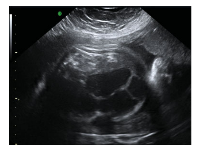
Fig. 4 Volvulus at 36 weeks of gestation showing striking tubular dilatation, suggested the development of fetal intestinal pathology.

Clinically, sluggish fetal movements or the observation of a nonreactive tracing on cardiotocography helps in reaching the diagnosis of volvulus.<sup>8</sup> Fetal distress such as decreased fetal movement and minimal/absent short-term heart rate variability can be presenting signs, as in our