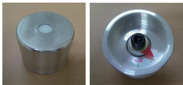
Figure 1. Photograph of the custom-made aluminum mold with a movable Teflon plate attached to a bolt.

Three layers of Sinfony indirect lab composite (3M ESPE, Seefeld, Germany) were used: A2 dentin (D2), E2 enamel (E2), and T1 translucent (T1) layers. To investigate the effect of shade on the power density, resin wafers of different shades measuring 0.5 mm in thickness were fabricated. The Teflon plate was lowered by 0.5 mm by rotating the bolt counterclockwise and the empty space in the aluminum mold was filled with one of the shades. Then, the upper surface of the aluminum mold was covered with a polyester film and a glass slab to put pressure on the surface and was light cured with a light emitting diode (LED) LCU (Elipar FreeLight 2, 3M ESPE, St Paul, MN, USA) for 5 seconds. After removing the glass slab and the polyester film, the dentin layer was light cured for 20 seconds using an overlapping curing procedure in order to ensure that every part of the specimen was light cured. Seven specimens of each resin wafer were fabricated.