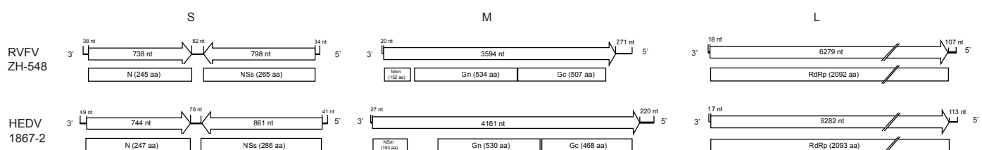
Figure 1. Schematic of the genome organization of HEDV1867-2 and Rift Valley fever virus strain ZH-548. Lines represent gene segments; arrows represent coding regions; and boxes represent transcribed proteins. The full lengths of the three gene segments of HEDV1867-2 and the deduced ORFs are 3 to 567 nt longer than those of ZH-548. The amino acids encoding the HEDV1867-2 proteins, except for glycoproteins Gn and Gc, which are 4 aa and 39 aa shorter, respectively, were 1 to 41 aa longer than those of ZH-548, and the non-structural proteins NSs and NSm were 21 and 41 aa longer, respectively.

The complete genome sequence of HEDV1867-2 was recovered by NGS and confirmed with reverse transcription PCR. The genome of the HEDV1867-2 isolate had three segments: the large (L) segment (6412 nt) encoding RNA-dependent RNA polymerase (RdRp); the medium (M) segment (4408 nt) encoding polyprotein; and the small (S) segment (1771 nt) encoding nucleoprotein (N) and a non-structural protein (NSs) (Figure 1).