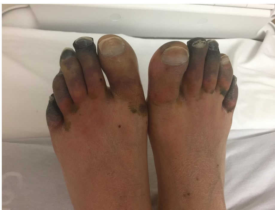
Figure 1. Bilateral gangrenous toes.

At presentation, his temperature was 98 °F (36.7 °C), his pulse was 103 beats per min, his blood pressure was 107/84 mm Hg, and his respiratory rate was 17 per min, maintaining saturation at 96% on room air. He was icteric on examination. He had sparse bibasilar rales on chest examination. Cardiac examination was suggestive of parasternal heave with an enlarged point of maximal impulse. He had dry and gangrenous second through fifth toes and densely cyanotic first toes, bilaterally (Figure 1). This subsequently progressed to necrosis of all his toes. He did not have any other skin or mucous membrane changes. His bilateral dorsalis pedis and posterior tibialis pulses were palpable.