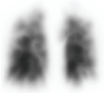
FIGURE 2: A lung perfusion scan showed multiple wedge-shaped perfusion defects in both lungs.

Following the diagnosis, the patient was treated with the anticoagulant warfarin, 1 course of chemotherapy with irinotecan (80 mg/m 2 on days 1, 8, and 15), and long-term oxygen therapy. Her shortness of breath upon exertion significantly improved initially; however, her respiratory condition gradually worsened, and follow-up CT scans showed multiple liver and bone metastatic lesions. Echocardiography indicated worsening pulmonary hypertension with tricuspid regurgitation, and the estimated gradient pressure was approximately