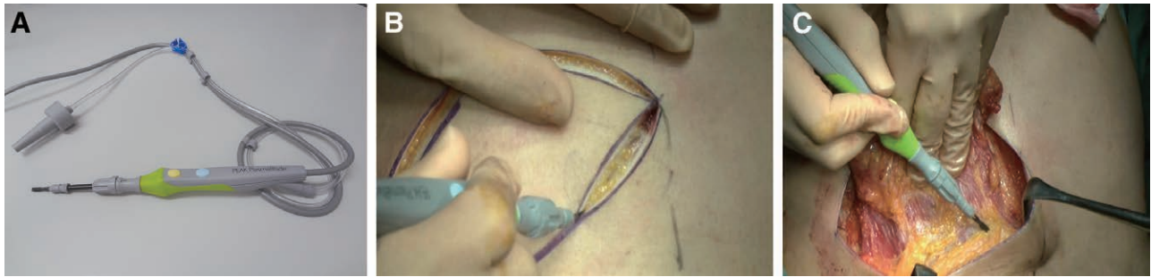
Fig. 1. The electro-surgical device and intraoperative pictures. A, The PPB (Medtronic Inc., Minneapolis, Minn.). Precise pulses of RF energy and proprietary insulation material on both sides of the blade enable the device to dissect like a scalpel and control bleeding, while causing minimal thermal damage to surrounding tissue. B, Intraoperative image of skin incision. C, The dissection surface of the LD muscle using the PPB. RF, radiofrequency.

formation, total drain discharge volume, indwelling period of drainage at the donor site, length of hospital stay, and operation time. In all patients, 15Fr vacuum drainage tubes were placed below the transplanted LD flap and donor site at completion of the surgical procedure. The drains were removed when drainage was < 30 mL/24h or at 2 weeks postoperatively. After drain removal, puncture drainage with a needle was performed once a week if liquid accumulated at the donor site. Seroma was defined as the persistence of seroma for more than 4 weeks postoperatively. Statistical analysis was performed with JMP (SAS Institute, Cary, N.C.) using an independent t test, Mann-Whitney U test, and a Pearson chi-square test for comparison between the groups.