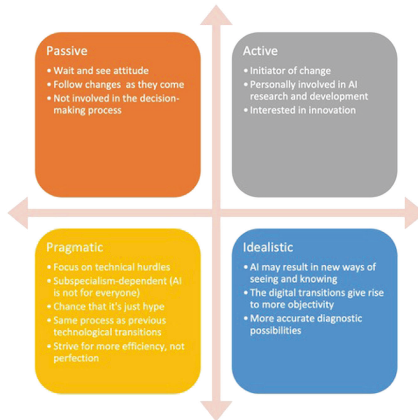
Fig. 1 Positioning of respondents concerning digital transitions.