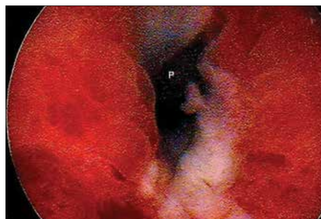
Fig. 3. Close view of the perforation (P).