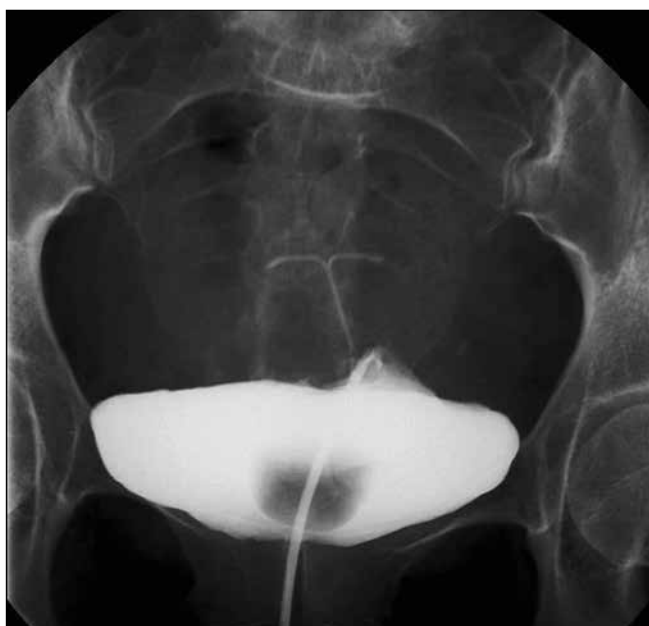
Fig. 4. Cystogram image four weeks post operation showing complete healing and no leak.

Although relatively rare, SRUB has been occasionally reported since the early 1900's. In the majority of cases, underlying bladder pathology has been identified, although idiopathic SRUB may occur. The diagnosis requires a high index of suspicion and must be on the differential diagnosis list when there is a similar clinical picture. Appropriate measures should be taken, including initial ultrasonography to help exclude urinary tract obstruction and