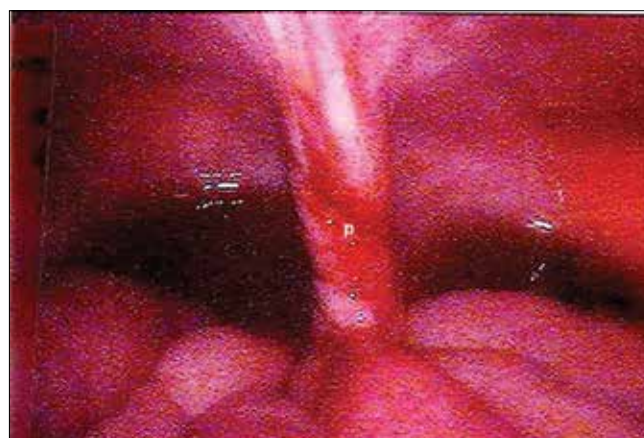
Fig. 2. Laparoscopic picture of the pelvis with free fluid behind and a small perforation (P) at the dome of the bladder.

The patient was catheterized with a 14F silicon catheter, which immediately drained 250 mL of bloodstained urine. A diuretic phase eventually resulted in normalization of her renal function. She had a CT scan that confirmed the presence of somewhat large amounts of free fluid in the peritoneum (Fig. 1), as well as normal kidneys and an empty bladder. The patient underwent an urgent diagnostic laparoscopy that revealed a flaccid empty bladder with a small perforation on the dome of the bladder (Figs. 2 and 3) with no other intra-abdominal pathologies. Biopsies were taken from the cut edge of the bladder and it was repaired using delayed