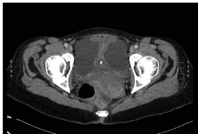
Fig. 1. CT scan of the pelvis showing free fluid around a collapsed empty bladder with the catheter tip within.

We report a case of idiopathic SRUB in a young female presented with abdominal pain and acute renal injury in the absence of prior trauma. We have conducted a literature review to identify commonly reported etiologies. SRUB is usually secondary to an underlying pathology, but in extremely rare cases it can be idiopathic.