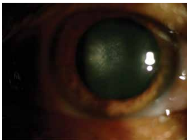
Figure 4. A Fuchs' uveitis syndrome patient with posterior subcapsular cataract development