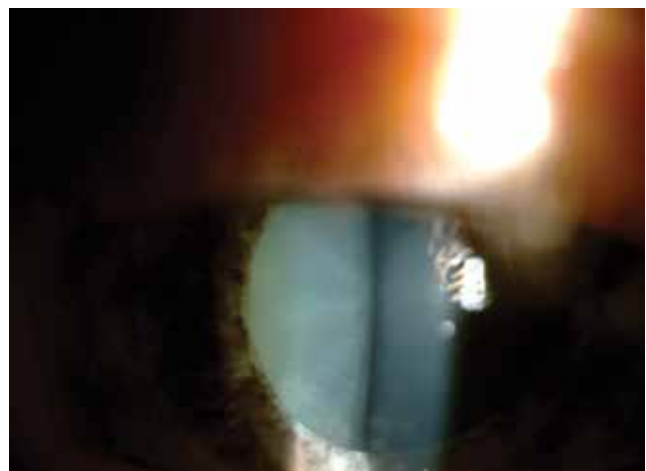
Figure 2. Iris atrophy is more pronounced in the pupillary margin