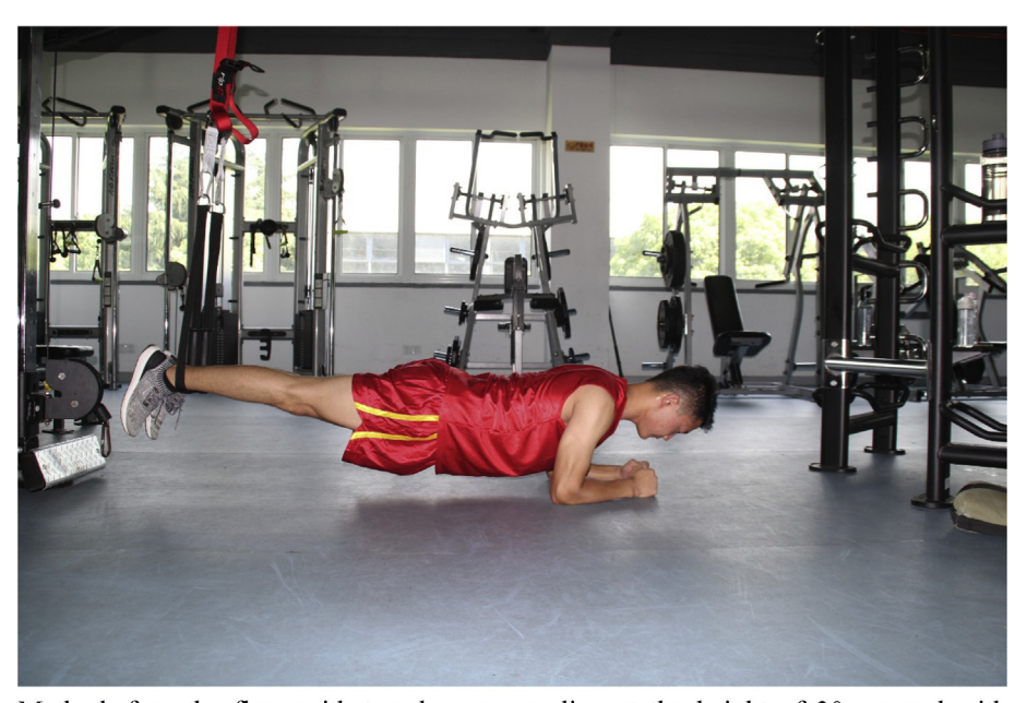
Method: face the floor with two legs suspending at the height of 30 cm and with weight on two elbows.