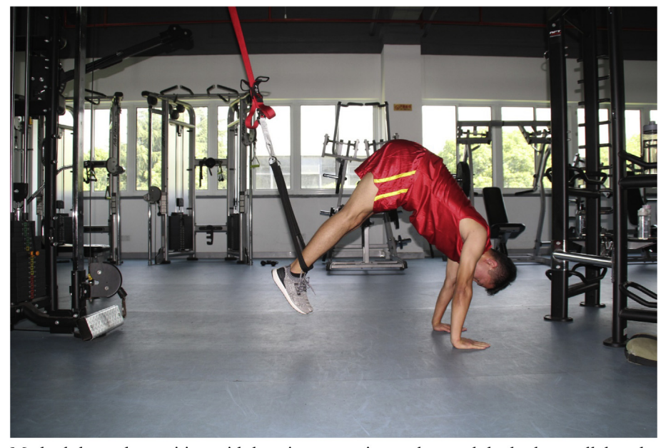
Method: keep the position with legs in suspension and extend the body parallel to the floor, then fold the body into the V shape. After that slowly unfold the body to the original position.

Fig. 5. Two legs suspension with hip and knees flexion.