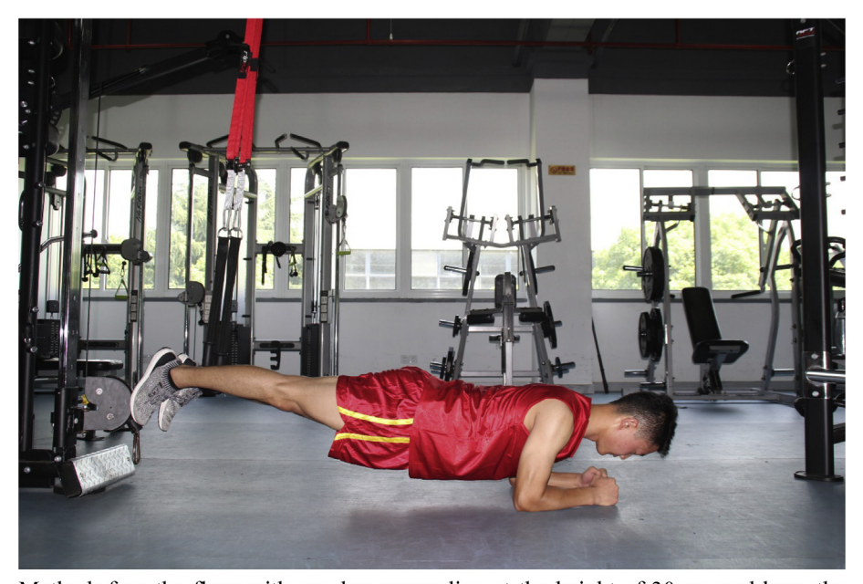
Method: face the floor with one leg suspending at the height of 30 cm and keep the other leg at the same height, but not in suspension.

Fig. 2. Single leg suspension (left or right) with weight on two elbows.