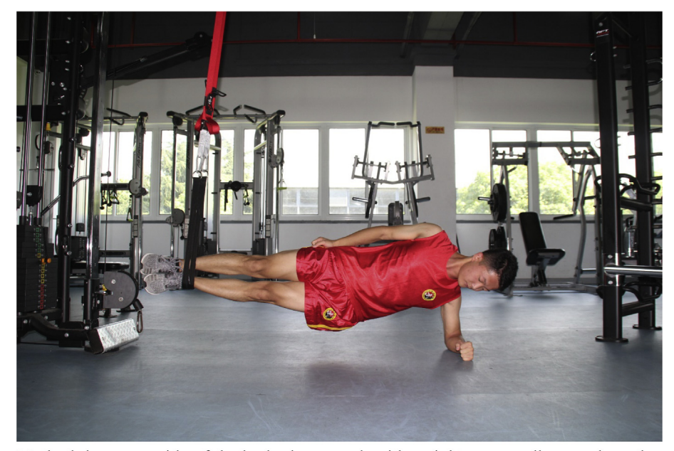
Method: keep one side of the body downward, with weight on one elbow and one leg suspending at the height of 30 cm and raise the other leg.