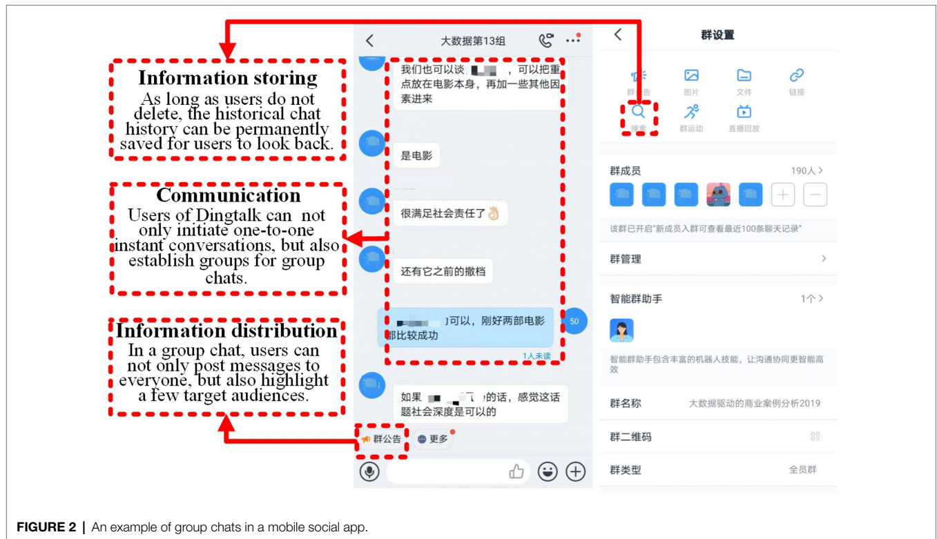
FIGURE 2 | An example of group chats in a mobile social app.