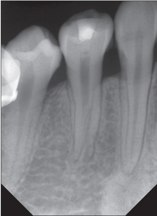
Figure 2: Formation dentin bridge on the periapical radiograph

slice) to allow calculation of the estimated volume of the reparative dentin bridge. The reparative dentin volume ranged from code 1 of high volume ( \geq 1 \text{ mm}^3 ), code 2 of moderate volume ( 0.5\text{--}0.99 \text{ mm}^3 ), code 3 of low volume ( 0.1\text{--}0.49 \text{ mm}^3 ), and code 4 of no dentin or immeasurable volume of dentin [Figure 3]. Intraoral digital and CBCT scan was captured on both patient and extracted teeth.