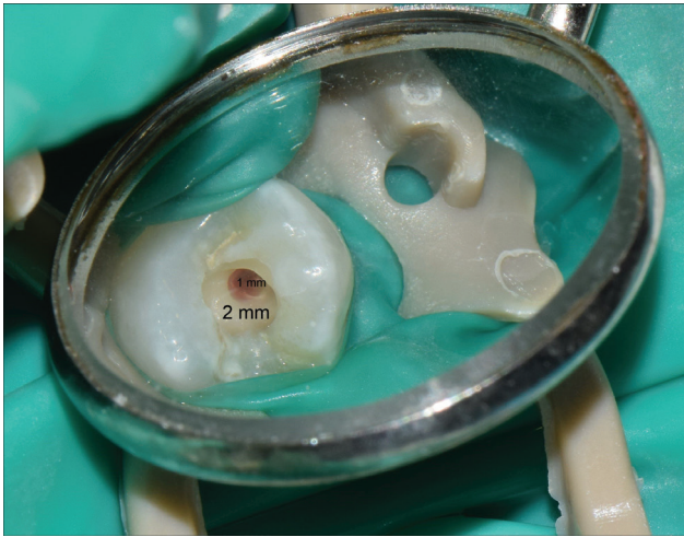
Figure 1: Dimensions of the prepared cavity

The pulp was exposed about 1 mm in diameter and directly capped with Biodentine. For achieving hemostasis, the cotton pellet moistened with sterilized saline was applied onto the exposed pulp for 1–9 min. Once bleeding stopped, the capping material was placed over the exposed pulp.