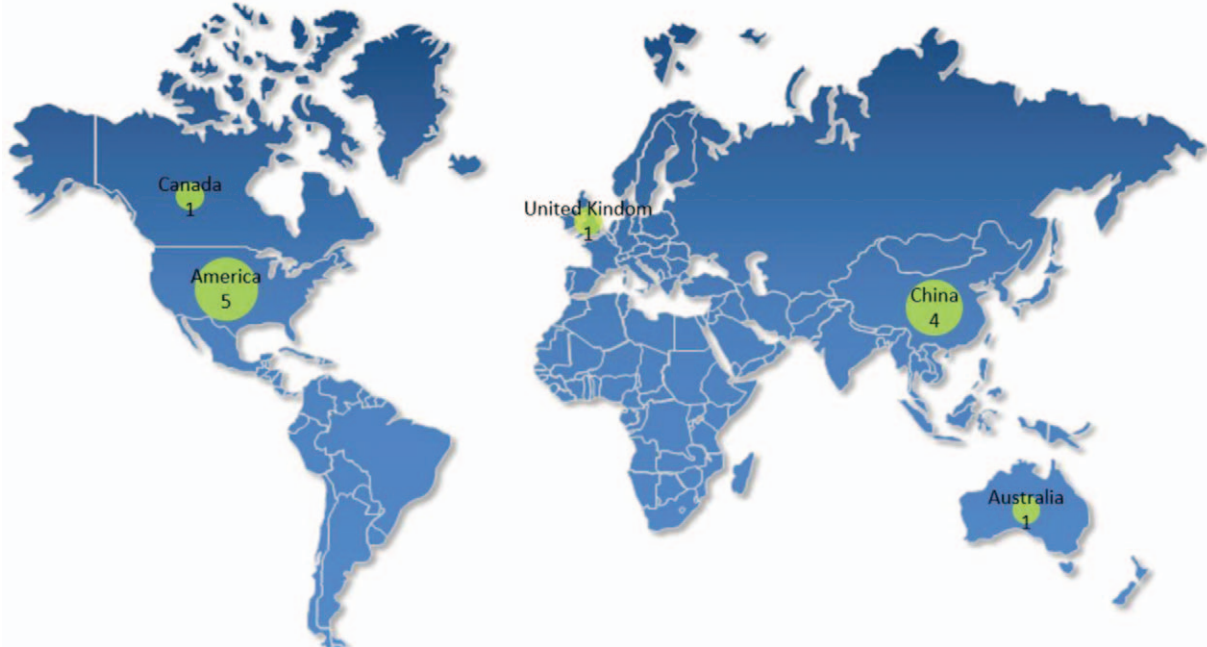
Figure 3. The distribution of CPGs across the world, where the circular areas represent the numbers of guidelines in each country.

channels for guideline publication. The included papers were only published in English and Chinese, resulting in omission of guidelines published in other geographical locations such as Turkey, Korea, and India. Individual differences are existing among patients, then the recommendations should be implemented for specific conditions and settings. Furthermore, there are 3 internationally recommended diagnostic criteria for PCOS by varying expert groups, the NIH Criteria, Rotterdam Consensus Criteria, and AE-PCOS, but we did not classify results by different diagnostic schema; thus, one should be cautious when extrapolating conclusions. Last but not the least, it is important to keep in mind that the RIGHT checklist does not use to assess the quality of the guideline methodology and the effectiveness of the recommendations in the guidelines, but it can