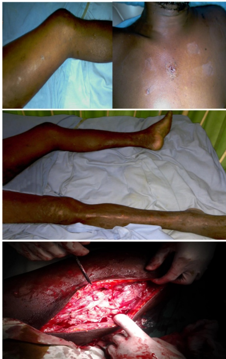
Figure 1 Initial clinical presentation and surgical intervention. The two top images depict the various healed and recent injuries sustained by the patient. The image in the middle shows a laterally rotated swollen left thigh and lower limb. The bottom image depicts necrotic muscle on surgical debridement of the left thigh.

Whole blood analysis revealed an elevated leucocyte count of 25.87 \times 10^9/\mu\text{L} (normal: 4 to 10) which was predominantly neutrophilic (83%; normal: 50 to 70) with preserved hemoglobin and platelets. Inflammatory markers were elevated with an erythrocyte sedimentation rate (ESR) of 51mm for the first hour (normal: < 15). His renal functions were within reference range and remained normal throughout. An X-ray of his abdomen revealed dilated gaseous bowel loops (Figure 2) while an X-ray of his left thigh failed to demonstrate any abnormality or gas (Figure 2). An urgent magnetic resonance imaging (MRI)