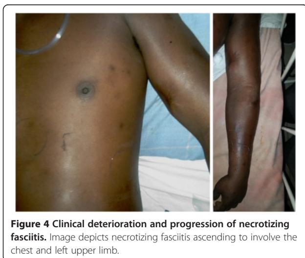
Figure 4 Clinical deterioration and progression of necrotizing fasciitis. Image depicts necrotizing fasciitis ascending to involve the chest and left upper limb.

11 to 18) which was normocytic and normochromic. Her preliminary renal profile was unaltered. Her international normalized ratio was mildly deranged at 1.42 (normal: 0.9 to 1.1), aspartate transaminase was elevated at 55U/L (normal: 10 to 35) but alkaline phosphatase and proteins