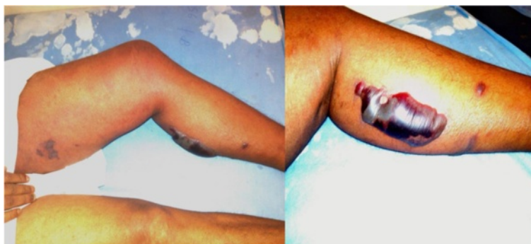
Figure 5 Superficial skin manifestations of necrotizing fasciitis. Image on the left shows early skin involvement of the left medial aspect of the thigh and bullae formation of the calf, which is more clearly demonstrated on the image on the right.

an effective immune response resulted in rapid progression of NF with sepsis and septic shock despite urgent surgical and medical intervention.