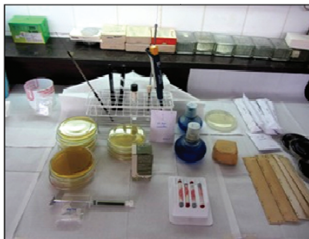
Figure 1: Sowing the Enterococcus faecalis strain

The BEA culture medium was prepared by mixing 40g of the dehydrated product in 1L of distilled water. The mixture was then subjected to heat until complete dissolution, and was then autoclaved for 15min at 121°C. After sterilization, this dissolution was kept at a temperature of 50°C, and then approximately 20mL was added to each of the disposable plastic petri dishes [Figure 2].