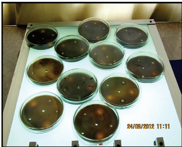
Figure 2: Petri dishes incubated for evaluation of antimicrobial efficacy

Post hoc analysis of the in vitro comparison of the antimicrobial efficacy of the modified \text{Ca}(\text{OH})_2 endodontic pastes found statistically significant differences among the three groups ( P = 0.001 ) [Table 2].