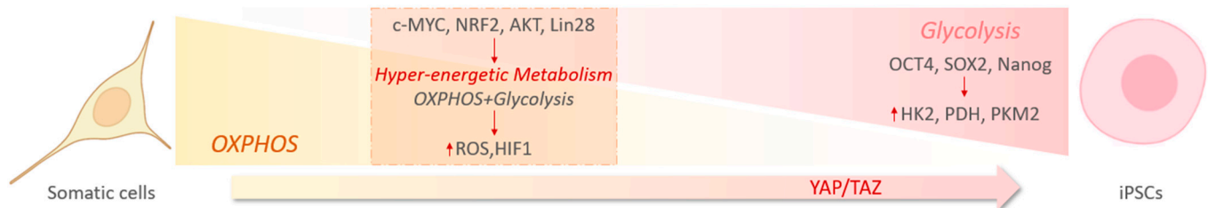
Figure 3. Cell reprogramming is accompanied by a decrease in OXPHOS and an increase in glycolysis. Shortly after reprogramming begins, cells undergo a transient hyperenergetic metabolism, which generates ROS, leading to the activation of HIF1, which further stimulates metabolic reprogramming together with c-MYC, NRF2, AKT and Lin28. A direct transcriptional regulation of glycolytic genes depends also on pluripotency factors OCT4, SOX2 and Nanog. YAP/TAZ activation may regulate the switch from OXPHOS to glycolysis in cell reprogramming, promoting glucose uptake and utilization, enhancing glutaminolysis, regulating the expression of metabolic genes, affecting epigenetic modifications to chromatin structure and post-transcriptional miRNA processing. Red arrows before ROS and HK2 mean “increased expression”.

All evidence supporting the involvement of YAP/TAZ in the metabolic remodeling of cancer cells [116] also suggest a possible role for these proteins in metabolic changes observed upon cellular reprogramming (Figure 3).