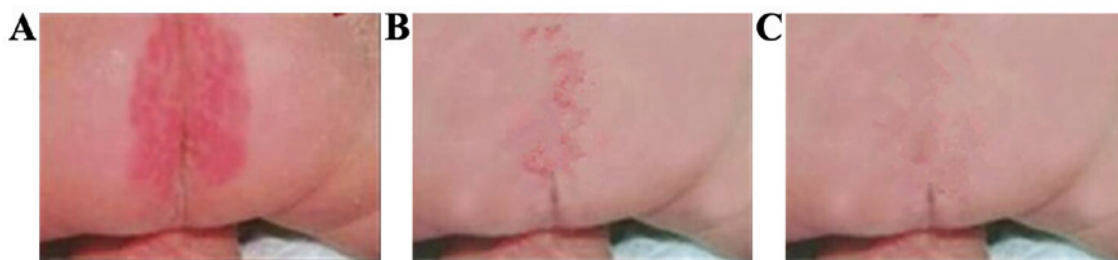
Figure 2. Images of an infant (severity grade I) pre- and post-treatment. (A) The symptoms of an infant (severity grade I) in group A before treatment; (B) the relieved symptoms of an infant (severity grade I) in group A 24 h after treatment; and (C) the healing of an infant (severity grade I) in Group A 5 days after treatment.

of stratum corneum, leading to gradual degeneration of the barrier function of epidermis, and as a result, fungi penetrated the skin and caused fungal infection. iii) Infant was of poor immunity and susceptible to diseases, thus the administra-