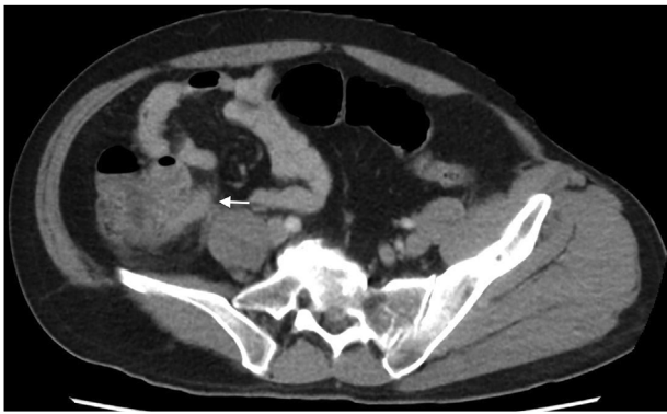
Fig. 1. Tubular image suggestive of appendicular stump with edema.