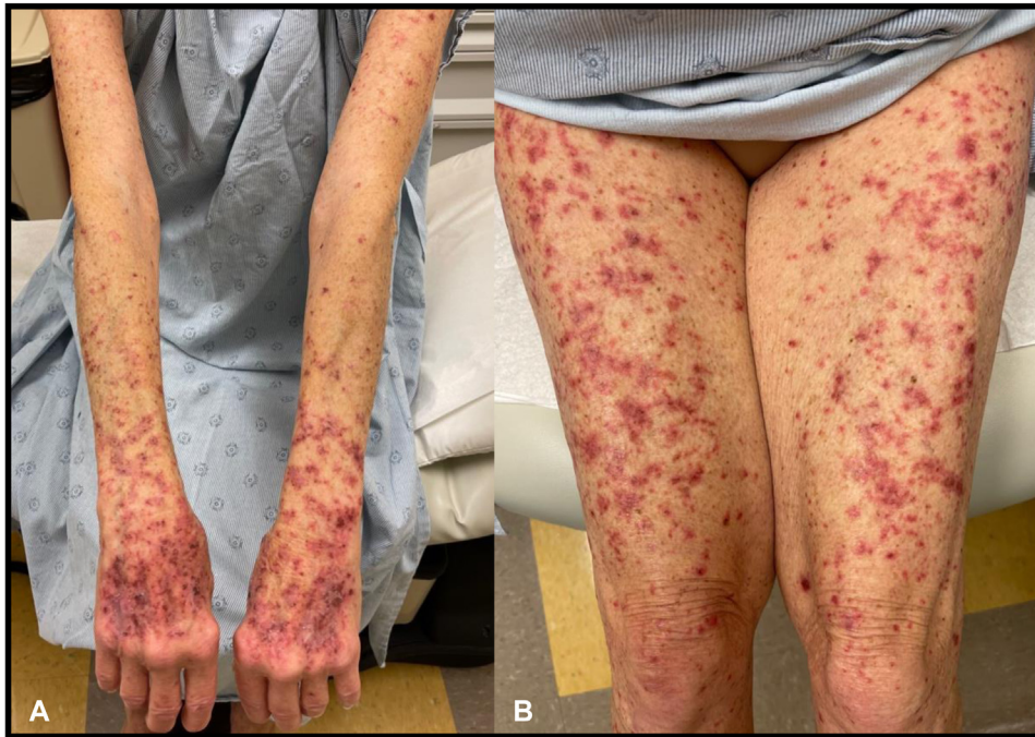
Fig 1. Clinical photographs of upper and lower extremities on initial examination. On exam, there were numerous 2-5mm pink-purple papules on the A) bilateral forearms, dorsal hands, and B) legs, many with overlying hemorrhagic crust.

The patient unsuccessfully trialed hydrocortisone 1% cream before seeing oncodermatology and was started on triamcinolone 0.1% cream applied to affected areas twice daily for 2 weeks. Pembrolizumab cycle 14 treatment was withheld in the interim. She noted mild improvement in those areas to which steroid cream was applied, but over the following 3 weeks, she noticed a pattern of mild resolution of old lesions alongside eruption of newly pruritic pink papules. Lesion development was characterized by a deep-red darkening of color with cessation of pruritus and sensation of warmth but with increased abundance of hemorrhagic crust at outer edges of lesions. Due to the lack of resolution, triamcinolone cream was discontinued, and the more potent clobetasol 0.05% cream was initiated for twice-daily application. A 4-mm punch biopsy was taken to delineate diagnosis and was consistent with parakeratosis with interface dermatitis and basal vacuolar degeneration, keratinocyte apoptosis, and epidermal necrosis with lichenoid reaction consistent with a lichenoid-like eruption (Fig 2). After 2 weeks of clobetasol cream treatment, significant improvement was noted. The rash improved significantly on the upper arms, forearms, dorsal aspects of the thighs, posterior aspects of the thighs, lower legs, and dorsal aspects of the feet and was particularly more confluent and much flatter with more violaceous hyperpigmentation noted. Over the next