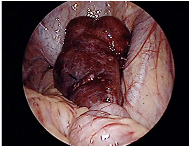
Fig. 2. Diagnostic laparoscopy revealed a twisted, dark-colored MD in the pelvis.