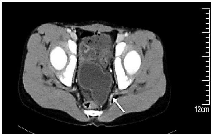
Fig. 1. Axial image from the contrast-enhanced CT scan. A gourd-shaped, fluid-filled structure with thickened wall (arrow) was located posterior to the bladder.

In conclusion, a very rare form of acute abdominal pain caused by a torsed gangrenous MD was found in the present case. The correct diagnosis of MD was made using exploratory laparoscopy in an emergent setting. Performing early surgery using diagnostic laparoscopy can help prevent significant morbidity and mortality in patients with complicated bowel pain of unclear etiology.