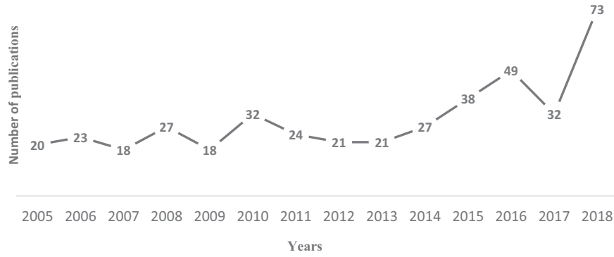
Figure 1. Year wise distribution of publications during 2005–2018.