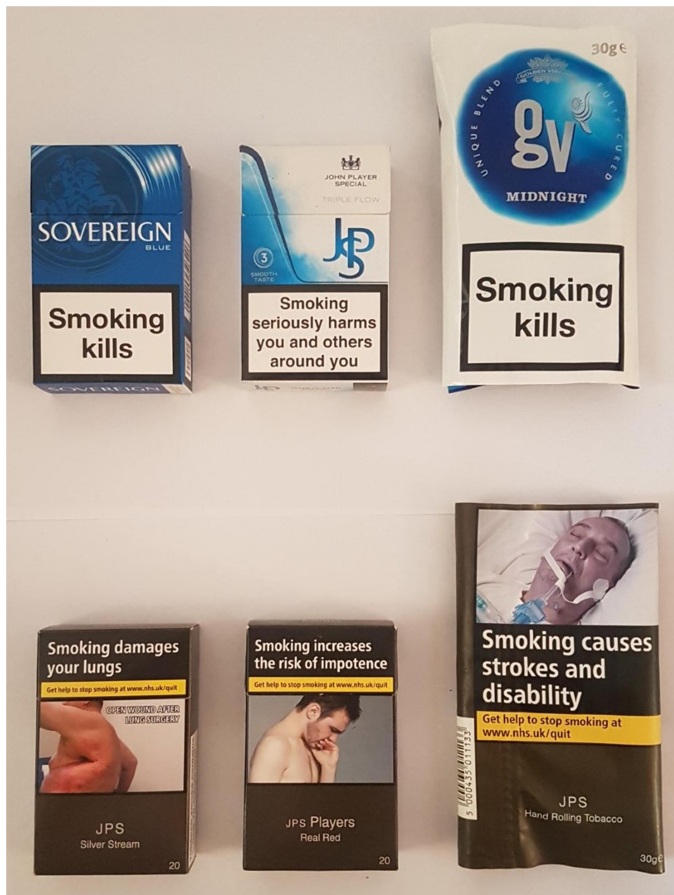
Figure 1 Examples of flip-top cigarette packs and rolling tobacco pouches pre-standardized packaging (top row) and post-standardized packaging (bottom row).

2020 for the second 16 ). Academic topic experts were also contacted.