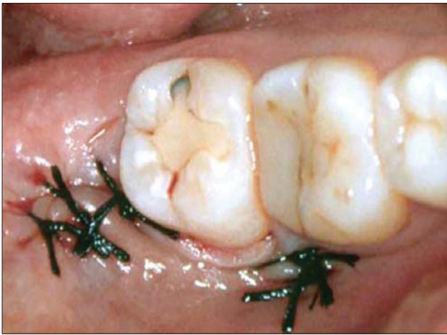
Figure 2: Group A, Primary closure: Flap design and clinical image