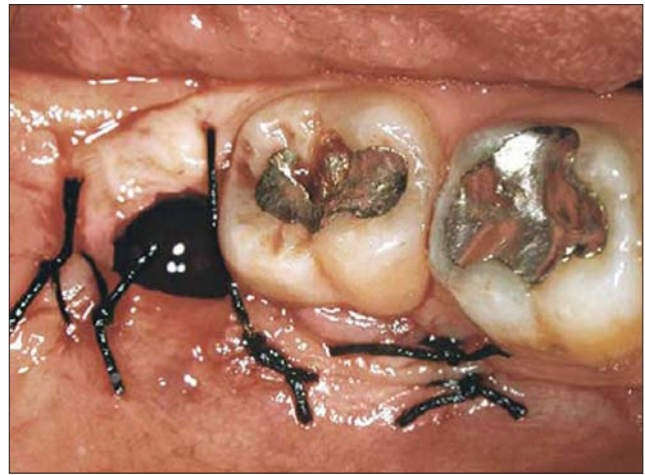
Figure 3: Group B, secondary closure: flap design and clinical image