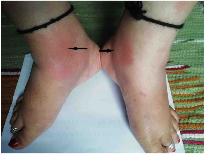
Figure 2 Bilateral ankle joint swelling and redness (acute sarcoid arthritis).