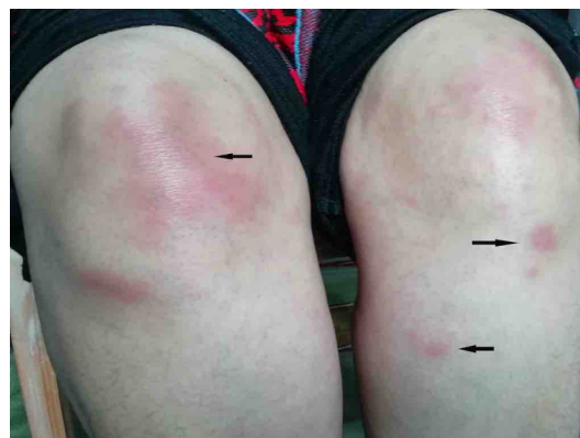
Figure 1 Clinical photograph shows erythematous, tender nodules on knee and shin (erythema nodosum).

On the basis of clinical picture, bilateral hilar lymphadenopathy and histological evidence of non-caseating granulomas, she was diagnosed with sarcoidosis with Lofgren's syndrome. Other differentials included extrapulmonary tuberculosis, septic arthritis, reactive arthritis and connective tissue disorders, for example, systemic lupus erythematosus and rheumatoid arthritis.