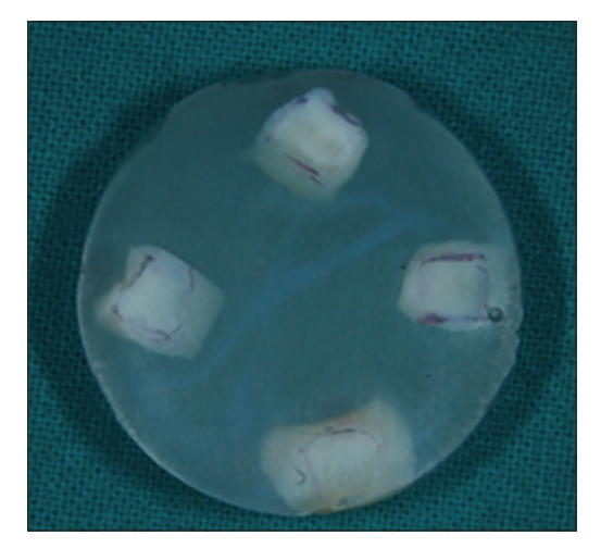
Figure 1: Enamel slabs embedded in acrylic resin (4 mm × 4 mm)

A Vickers diamond indenter (HMV Shimadzu, Japan) was used in a standard microhardness tester for specimen